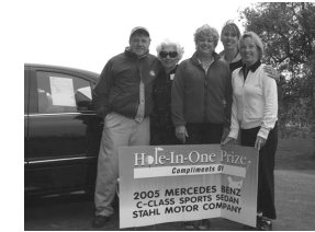
Golf Committee at the Hole in One

The MCPOA 2nd Annual Golf Tournament was held this year at Rancho Canada on Friday, June 3rd. Thanks to all the efforts of the golf committee and all the volunteers, the 2005 Tournament was a great success. This year partial proceeds raised will benefit the Monterey Public Library.